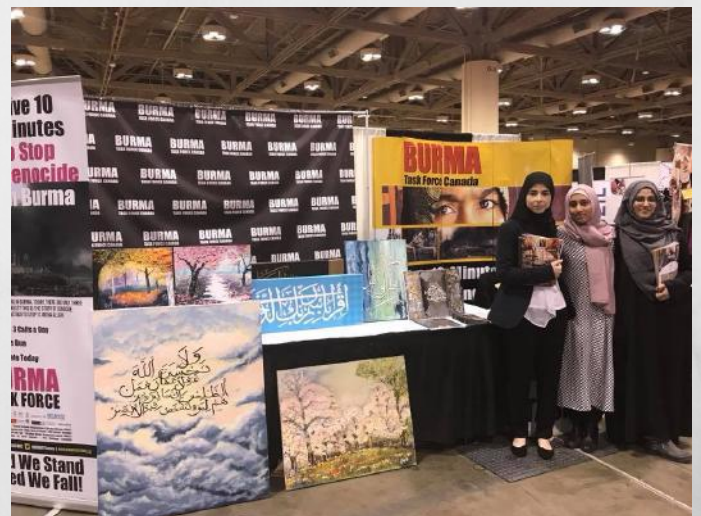
We were joined by a number of talented artists from MY Voice at RIS. They will be auctioning off their artwork to support BTF's work.