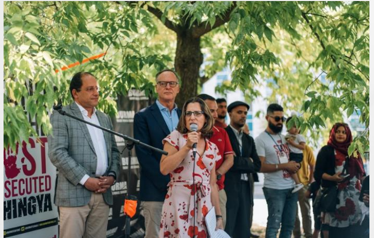
Minister of Foreign Affairs, Chrystia Freeland attends the BTF rally on September 16th and condemns the crisis.